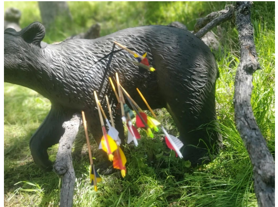
This one of the largest traditional archery competitions in the West, and was attended by a number of Conejo Members. There were reportedly over 500 attendees. The tournament consisted of 3 courses - most people shot 2 on the first day and 1 on the second.