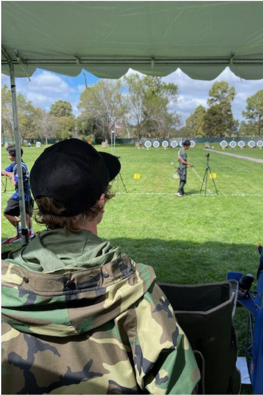
The sun did come out briefly!