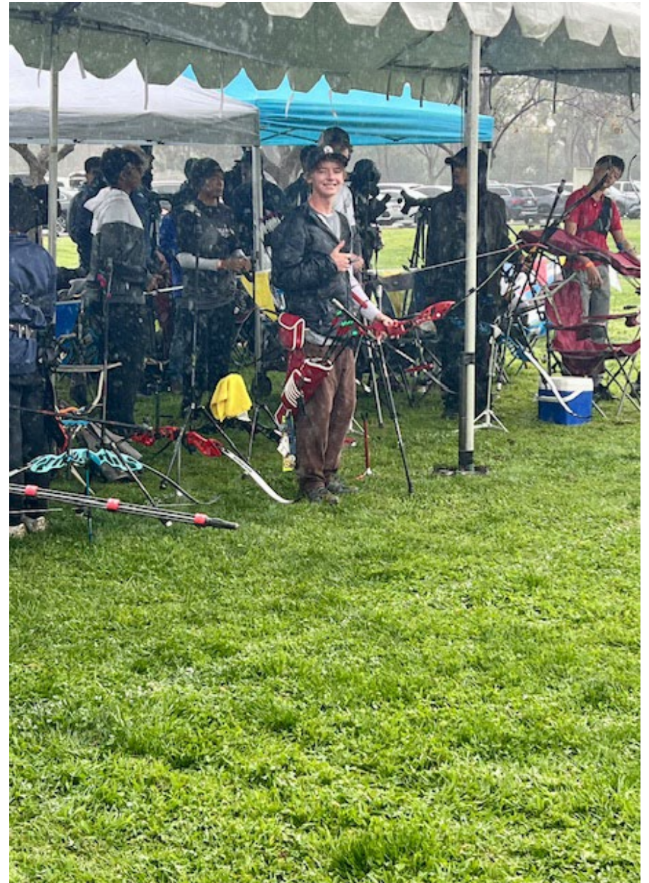
One of several rain delays....