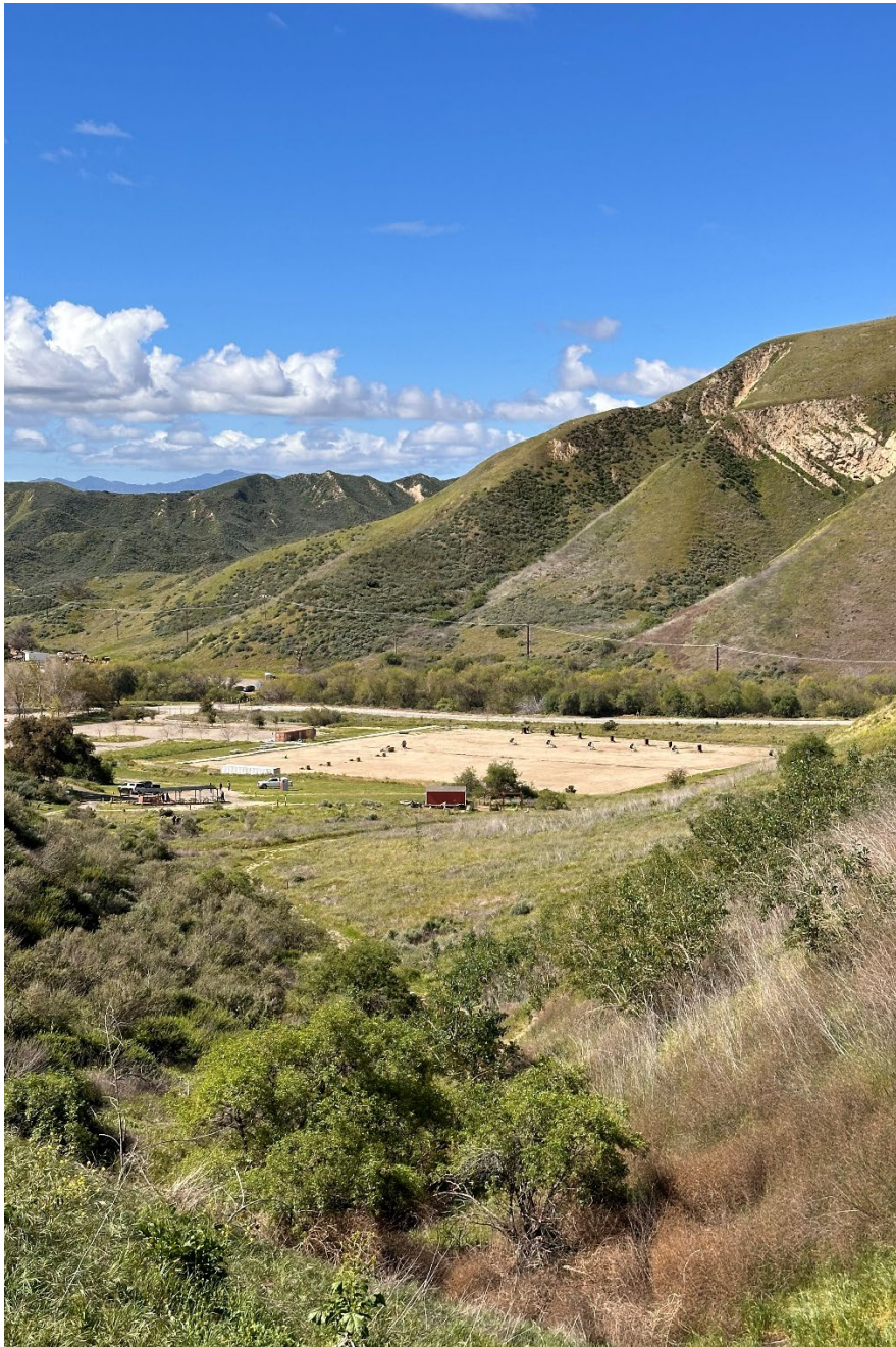
Great view of the Tournament Range