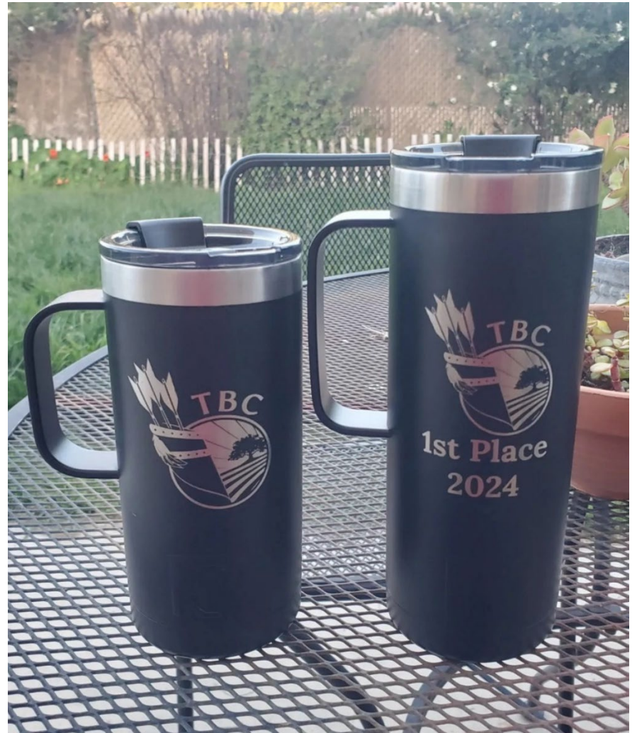
Some Nice Trophy Mugs