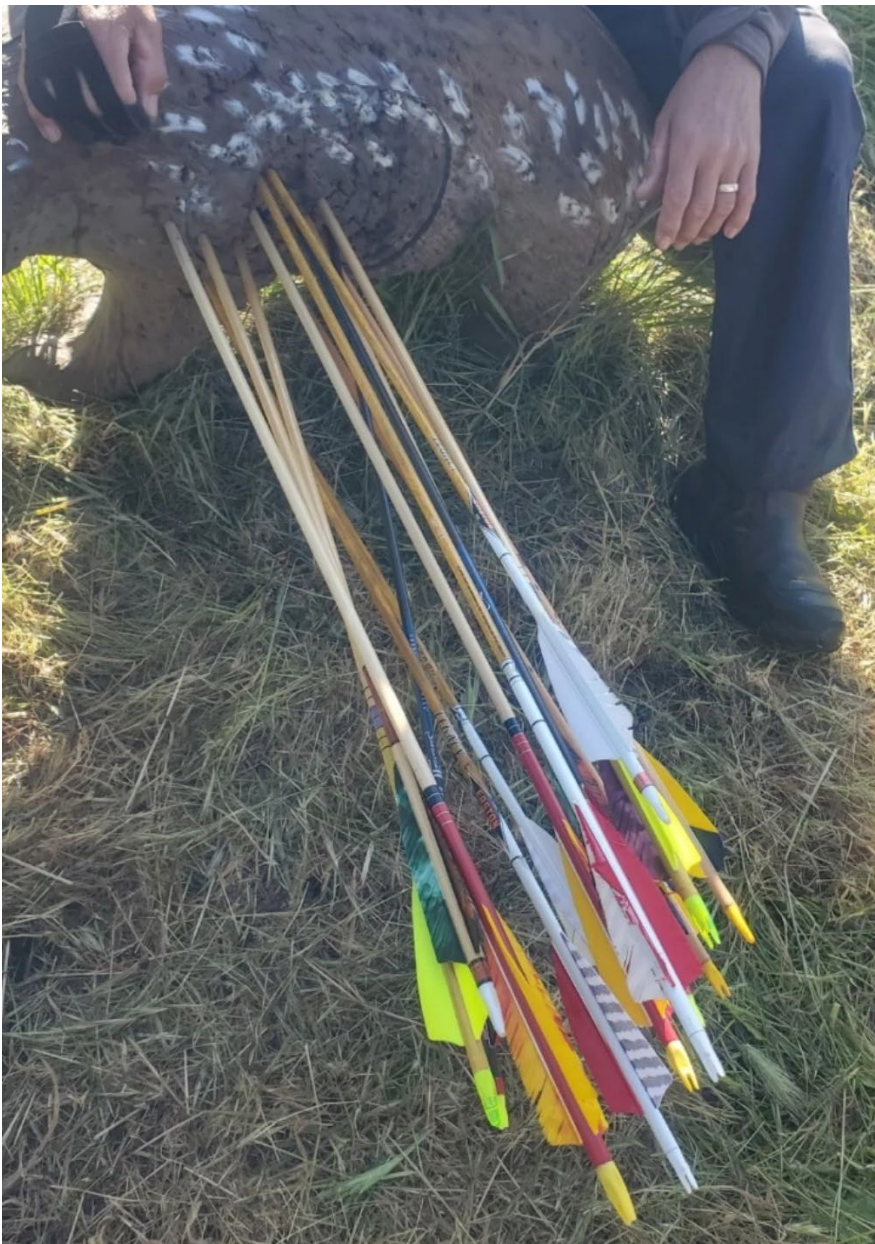
Some nice tight shooting