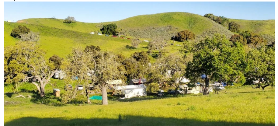
Yup, some familiar names there