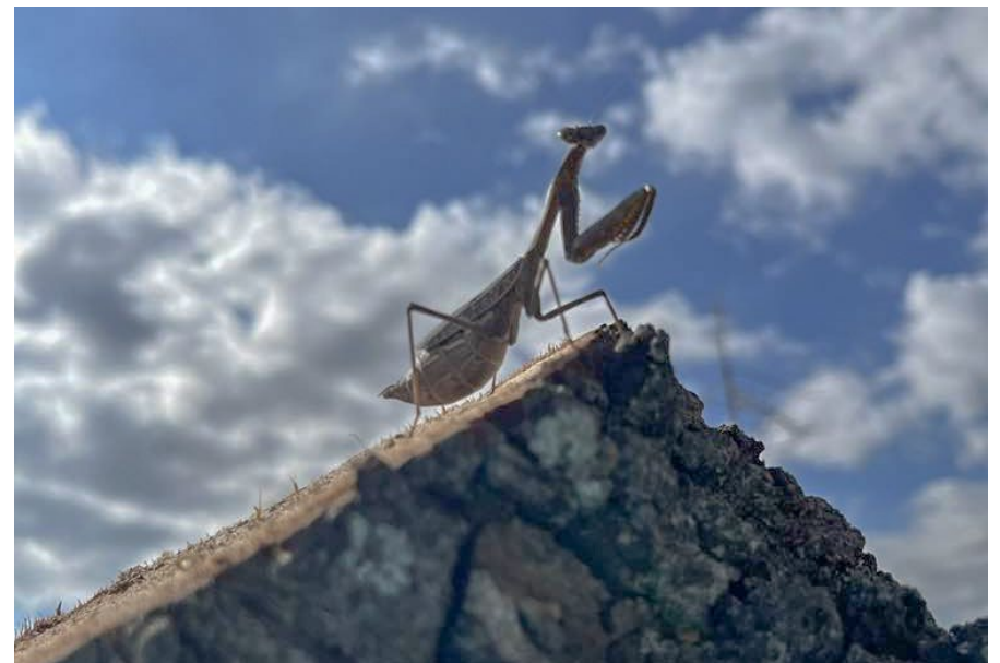
One of our Range Friends

Remember, archery is easy. Shoot a 10, do it again!