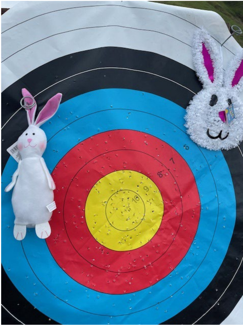
The targets were decorated for our three Easter archers.